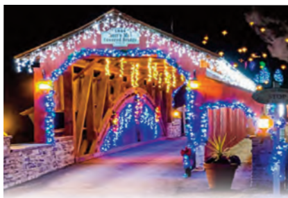
Christmas Light Drive Thru