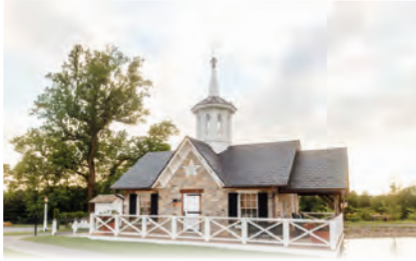
Lodging | 6 Unique Lodging Accommodations