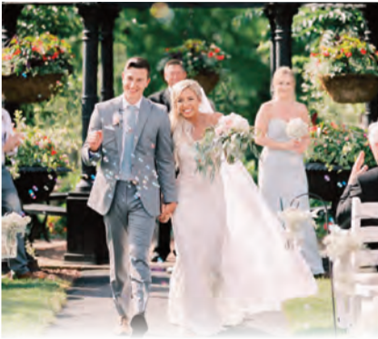
Weddings | Three Spectacular Venues