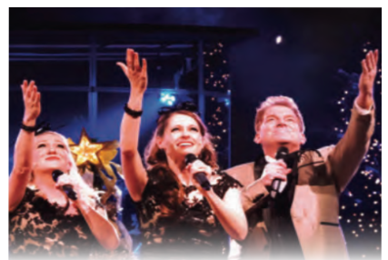
Christmas Dinner & Show