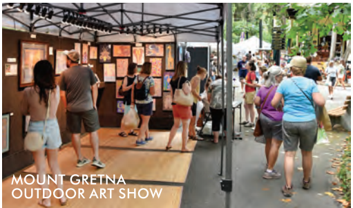
MOUNT GREтна OUTDOOR ART SHOW

A trip to the Lebanon Valley is a good idea at any time of the year, but we'd be lying if we didn't agree that there is just something special about summertime in the Lebanon Valley. From the annual Lebanon Area Fair to outdoor dining under the trees in Mt. Gretna, we've compiled a bucket list of the TOP FIVE THINGS TO DO in the Lebanon Valley this summer. So, whether you're three hours down the turnpike or a few minutes down the road, be sure to check out these places and events around the Lebanon Valley this summer!