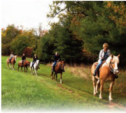
Horse Back Rides | March through November