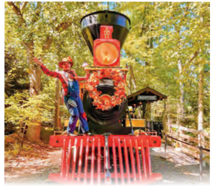
Train Rides | Visit our Website for our Variety of Train Rides