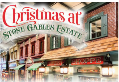
National Christmas Center